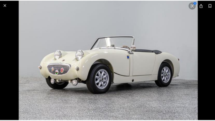
AutoBarn Classic Cars 1959 Austin-Healey Bugeye Sprite | Auto Barn Classic Cars Images may be subject to copyright. Learn More