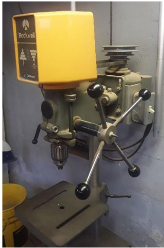
Drill Press $150