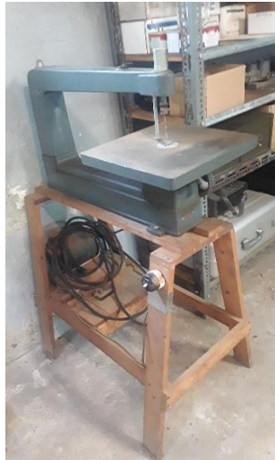
Scroll Saw $200