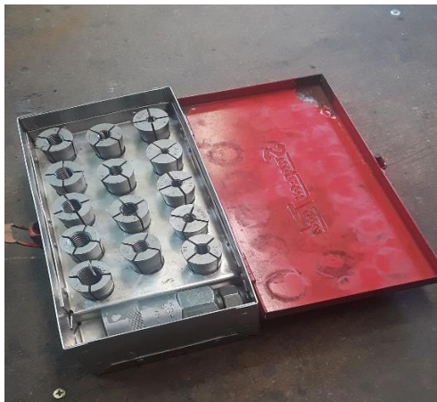
Snapon Stud Puller $200